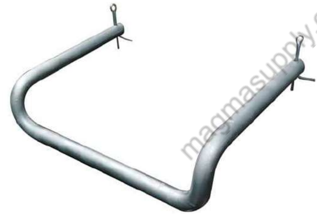
ISOMETRIC 3D VIEW